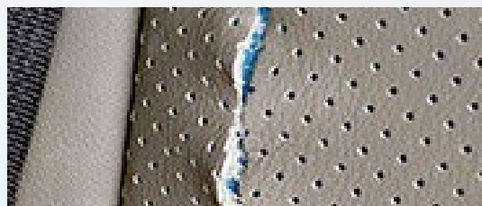
Interior cuts, burns or stains