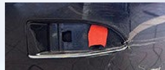
Broken or scratched windshield, windows, mirrors or lights