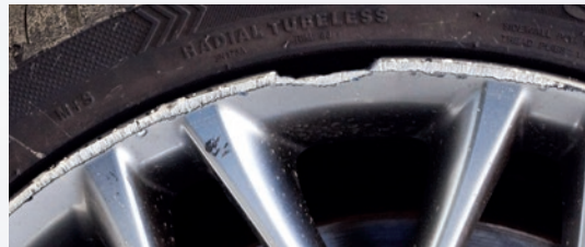
Damage to tires, rims or hubcaps