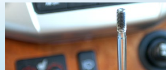
Missing parts or equipment

Photos are examples only. Covered wear and use items must be within plan limits.