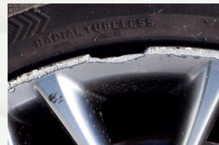
GOUGED ALLOY WHEEL